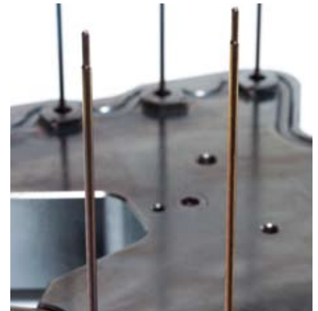
Refurbishment techniques such as fluidized beds restore hot runners to like-new levels.

Husky Injection Molding Systems www.husky.ca