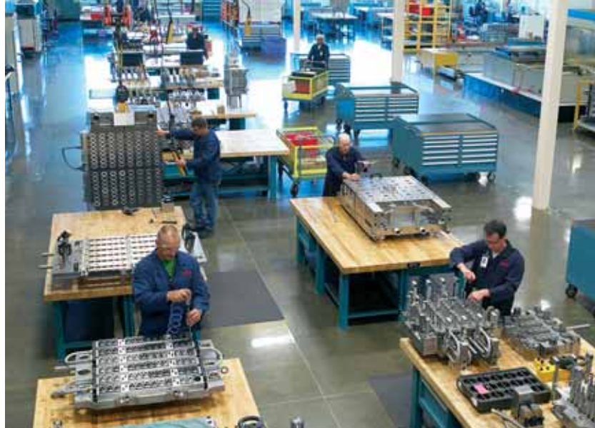
PET mold refurbishment helps improve performance.