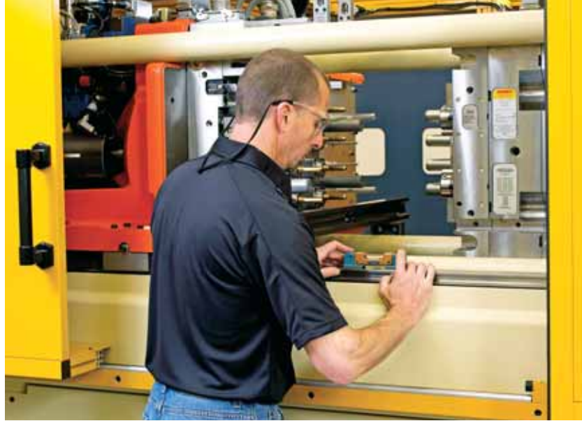
Husky trained technicians perform maintenance to reduce mold wear.